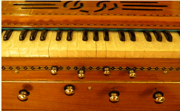
EXOTIC INSTRUMENTS, ELEGANT SETTING