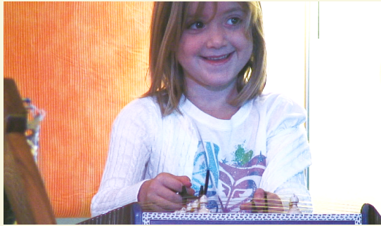
FUN FOR ALL AGES